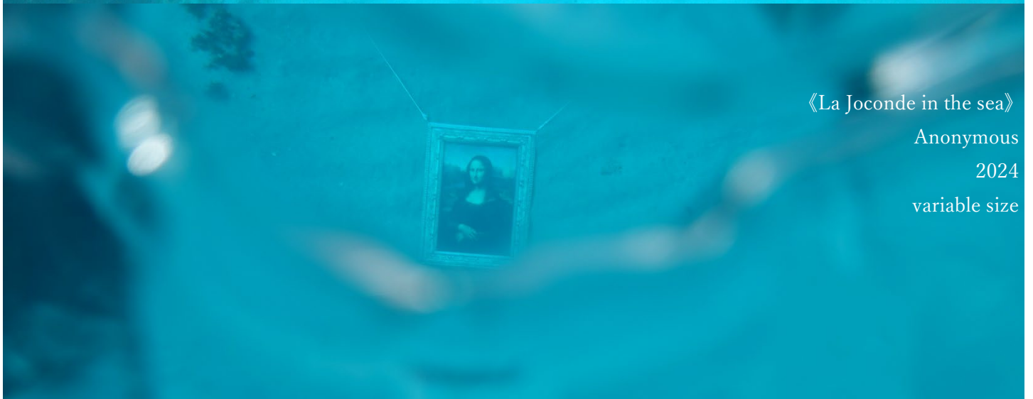
《La Joconde in the sea》